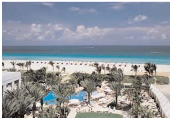
Book your room at the Loews Miami Beach Hotel using the form provided on line at www.TheASSR.org

Two Lunch and Learn sessions have been added to this year's program. This will offer an opportunity for meeting attendees, and their accompanying spouse or guest if desired, to sign up for a boxed lunch and enjoy lively presentations on timely topics. The first Lunch and Learn session, "The Cutting Edge," looks at innovative treatments for spine intervention including robotics and radiosurgery. A second Lunch and Learn session examines the issues of HIPPA regulation, and medical malpractice and reform. We encourage all meeting registrants to attend these special sessions. There is no additional registration fee; however, there is a small charge for a boxed lunch. Please indicate the number of lunches required for you and your guests on your registration form.