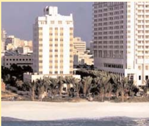
The centrally-located Loews Miami Beach Hotel offers attendees and guests opportunities to enjoy the best of Miami Beach activities and night life.

Hotel accommodations at the significantly discounted ASSR Symposium rate are still available at the Loews Miami Beach Hotel. February is high season in Miami Beach, and hotel space is at a premium, so book your room(s) now! Contact the Loews and ask for the ASSR Symposium rate. Hotel contact information and a special housing form are available online at www.TheASSR.org .